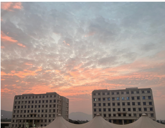
BEAUTY OF WINTERS